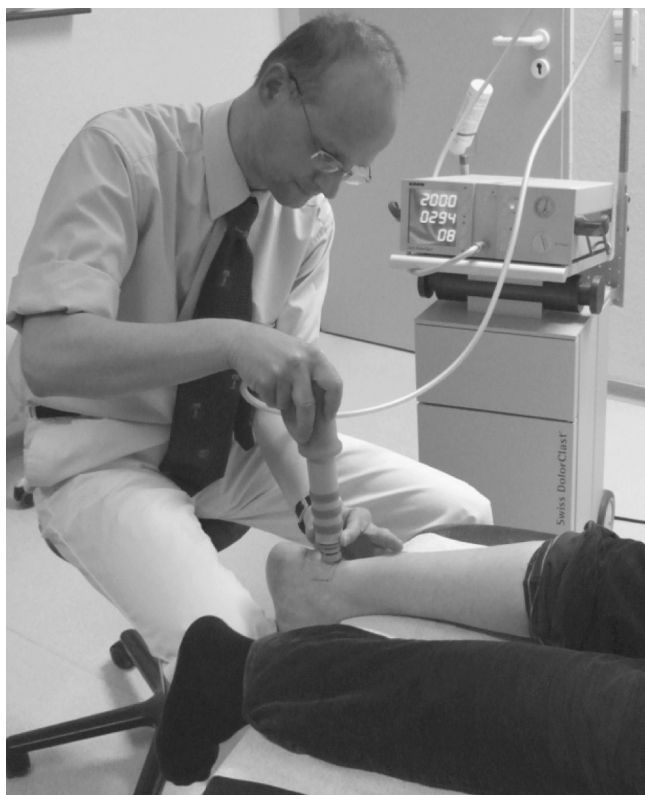
Figure 2. Application of shock-wave treatment.

sport, he or she automatically loses at least 10, and possibly 20, points.